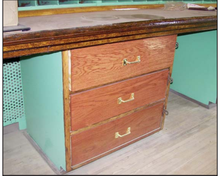
Some of the personal effects drawers, stained and in place in the RPO car. Bill Nickelson used the one remaining original drawer as a guide for creating the eight additional ones.

The baggage room on the car is being repaired and painted. We hope to stow and exhibit some Railway Post Office memorabilia there.