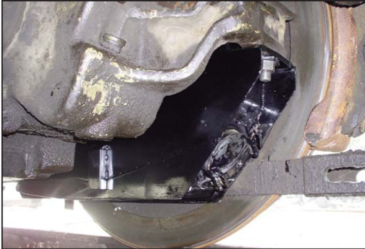
A closer look at the traction motor gear case.

maintaining our equipment. In addition to our rolling stock of railroad equipment, that includes our trusty backhoe, dump truck, pickup truck, and lawnmower.