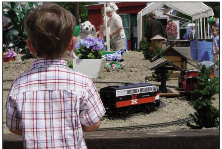
Young man mesmerized by the new G-scale layout in the railyard.