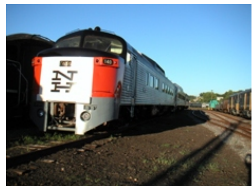
The Roger Williams Train Set