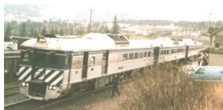
" The Cariboo Prospector " ready to leave Prince George, B. C.