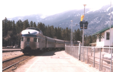
" The Skeena " as it departs from Jasper.

This 4-8-2 passenger locomotive is on display at Jasper. A plaque says that it was built in 1929, and operated until 1974. My question: How many of us would look this good after working for 45 years followed by 28 years of retirement?