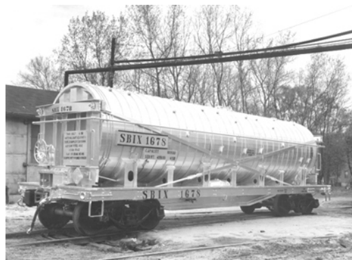
SBIX 1678, an 8,000 gallon wooden vinegat tank car at Standard Brands Peekskill, NY plant.