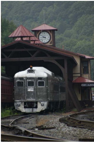
RBMN RDC-3 #9166 At Port Clinton