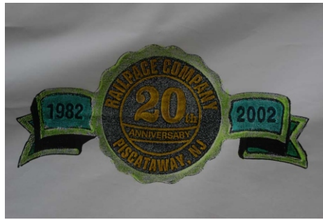
Railpace 20th. Anniversary