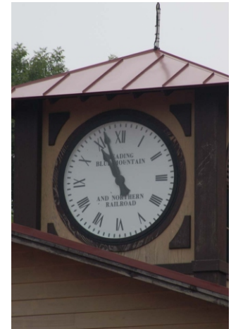
Clock Tower above Administration Building