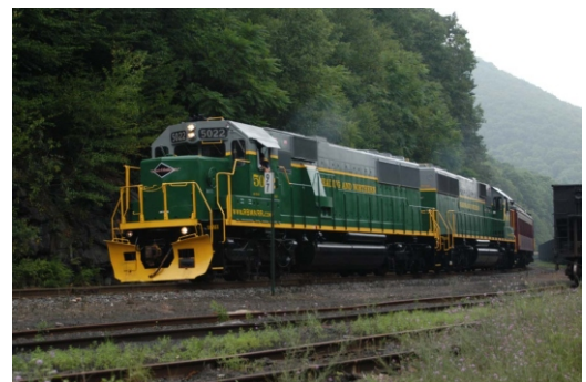
Photo run-by of RBMN 5022 & 5049