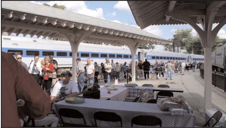
Riders of the Metro-North fan trip disembark the train and descend upon the Museum.

The train was scheduled to arrive at the DRM at 2:50pm, but arrived...early? Yes, early. Who would have thought. It is a good thing our volunteers are so