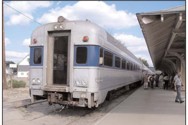
Sixty first-class passengers rode the special train in the Phoebe Snow cars. They were built by the Budd Company in 1949 for the Delaware, Lackawanna, & Western Railroad. Now they are used as Metro-North's Business/Inspection cars for senior operating management.

The DRM volunteers really enjoyed having a large group visit the Museum. The event was run very