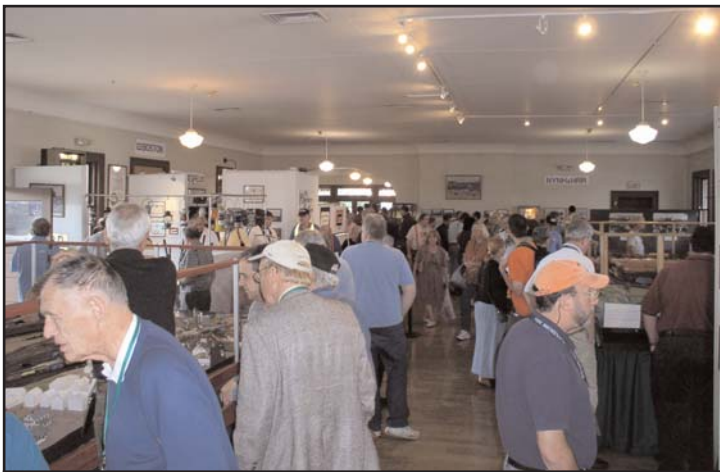
Over 300 visitors saw DRM exhibits.

versatile. The staff was going to be stationed at the various exhibits in the yard and run trains back and forth in the yard for the little over an hour the riders were scheduled to visit. Their early arrival led our operations staff to do some quick thinking and get the