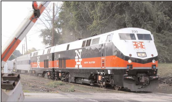
"New Haven" painted Genesis locomotives pull the special Beacon Line train into the DRM station.

On Sunday, September 12th, a Metro-North Railroad special rail fan excursion stopped at the