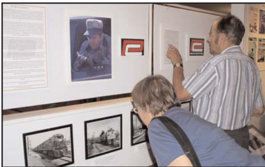
DRM volunteers were among the first to view the new photo exhibit.

Museum's newest exhibit: Changing Tracks: The Penn Central Railroad 1969-1976 . The exhibit features historic