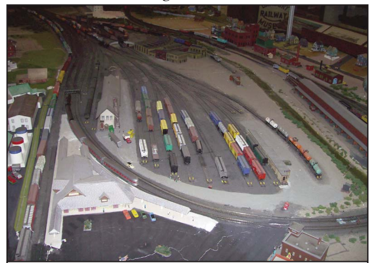
The N-scale layout today still needs work to enhance it. Are you available to help with it?