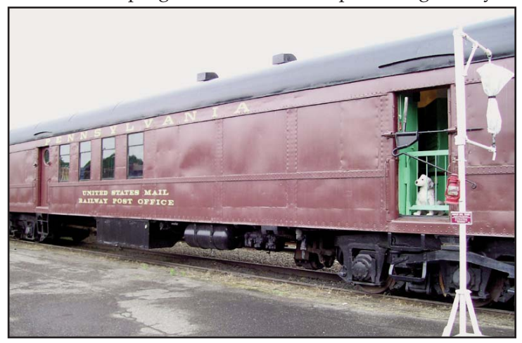
Continued on Page 5

Our DRM guests enthusiastically celebrated what is becoming an annual event on the Museum calendar. In keeping with our focus of providing family