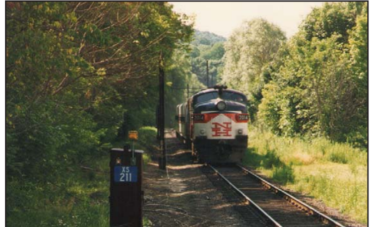
Can you identify the location of this photo of Metro-North FL-9 2014 taken July 1, 1997? It could be somewhere relatively local to Danbury.