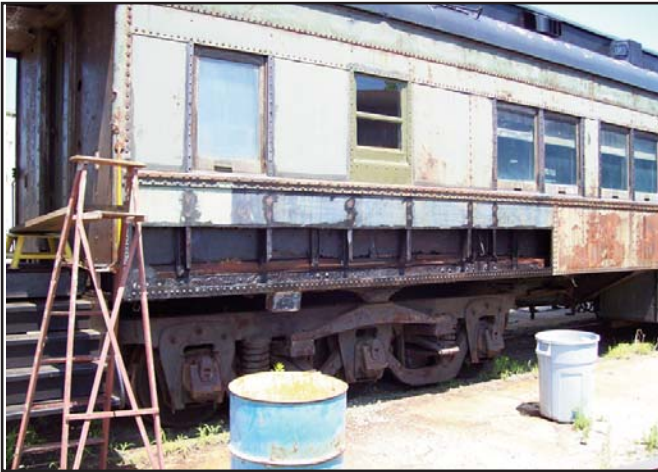
Top left, a photo of the finished interior; top right, cake celebrating dedication of the restored RPO car; left, work on the Tonawanda Valley; right, after restoration work